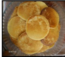
Pancakes (at request)