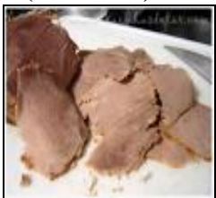
Roast beef (thin slices)