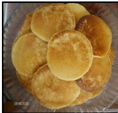
Pancakes (at request)