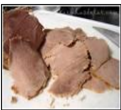
Roast beef (thin slices)